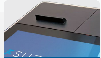
Sealed Spill-Proof Design 9° Slant – No Drink Placement