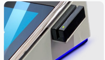
Encourage In-Play Bets