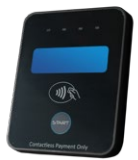
Payter P66 Unit

Tools Multiconfig configuration software