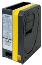
Evolution hoppers with extensions