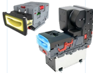
NV11 or NV10 banknote readers