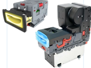
NV11 or NV10 banknote readers