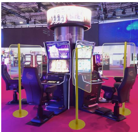
Slot Machine Separators High Quality, Custom Solution Keeps More Machines Operational