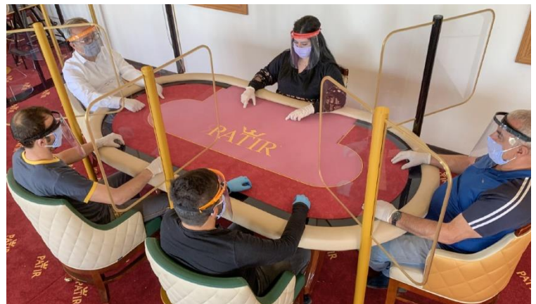
Table Game Separators High-Quality, Custom-Designed to Maintain Normal Game Experience with Added Protection