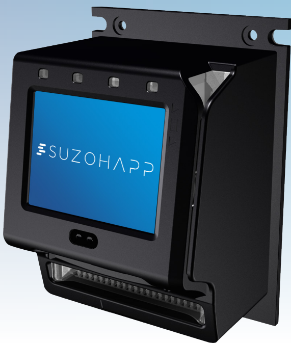
UPT-B Card Reader With Bill Validator Bezel

For Mag Stripe, Chip and Contact Payments