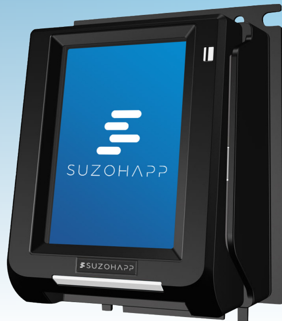
UPT-F Card Reader