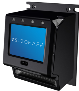
UPT-B Card Reader With Bill Validator Bezel