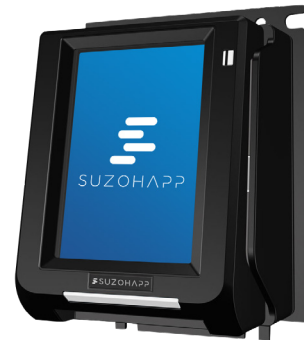
UPT-F Card Reader