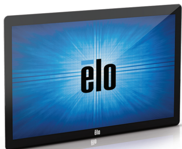
Elo Touch Solutions Open Frame Monitors