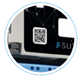
QR-Code for local wireless connection