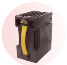
SC Series Cashbox