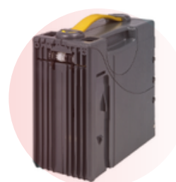
Cashbox for SC Series