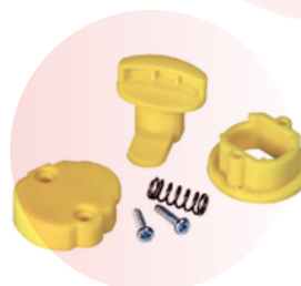
Yellow Lock for Cashbox