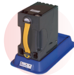
Easitrax Soft Count