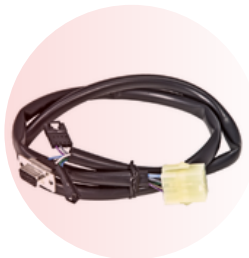
RS232 Cable for SC Series