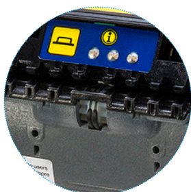
Diagnostic LEDs, configuration button and USB port located in the front face of the validator for an easier access