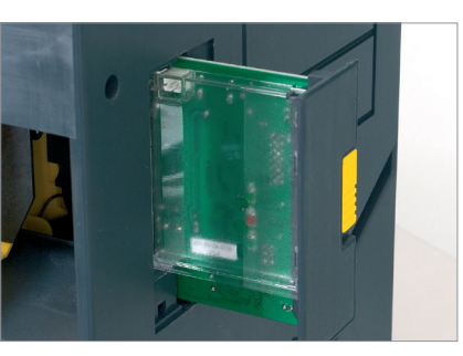
Board easily extractible from the outside